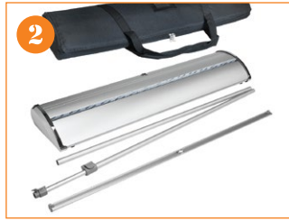
2. Open the bag and take out the base hardware and poles.