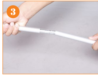
3. Connect the telescopic clip pole.