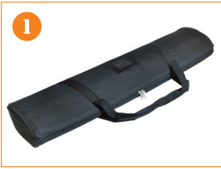
1. Shermo Lite Black Padded Bag.