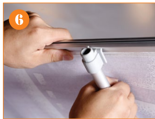
6. Attach the top bar on the top clamp profile.